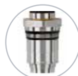
XNX EC Sensor

The Multi Purpose Detector (MPD) is a serviceable stainless steel sensor housing with plug-in catalytic and infrared sensor cartridges. The catalytic sensors measure flammable gases in the range 0-100%LEL and the infrared sensors measure Hydrocarbons in the range 0-100%LEL, or Methane 0-100%LEL (or 0-5%Vol) and CO 2 0-5%Vol. See the specifications section for full details of the MPD sensor.