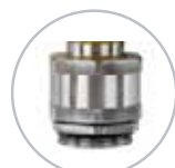
XNX MPD Sensor