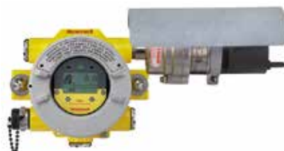
XNX with Searchpoint Optima Plus

XNX is compatible with all of the Honeywell Analytics range of industrial fixed gas sensors including Searchline Excel, Searchpoint Optima Plus, Sensepoint (HT and PPM) and Model 705. For further information on these sensors, please refer to their individual datasheets.